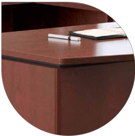
Beaded edge banding and floating top