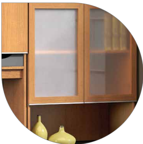
Frosted glass and extruded aluminum pulls