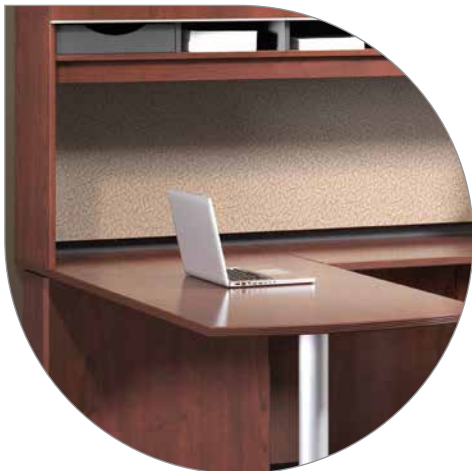
Durable thermally fused work surfaces