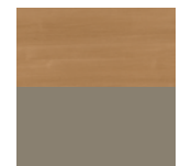
Light Oak with Sage (LO/643)