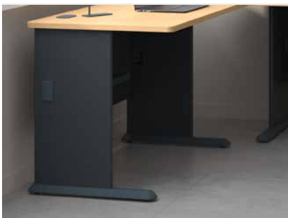
Open for Business

VERSATILE C-LEG TABLE DESIGN PERMITS EASY CONFIGURATIONS. IDEAL FOR OPEN SPACE OFFICES, CUBICLES, MULTI-PERSON WORKSTATIONS AND SMALL SPACE SOLUTIONS.