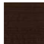
Mocha Cherry (MR/129)