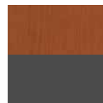
Auburn Maple/Graphite Gray (AU/485)